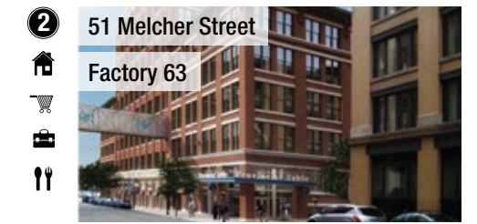
2 51 Melcher Street

$5.5M, 12,000 SF, center of the Innovation District - gathering place for innovation community, public infrastructure to facilitate networking & connection. Flexible interior spaces: events, pop-up retail, exhibitions, data-gathering, conferences. 4000 SF restaurant/outdoor seating. Developer: BGI