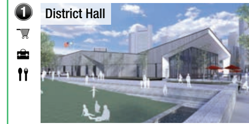
1 District Hall

$5.5M, 12,000 SF, center of the Innovation District - gathering place for innovation community, public infrastructure to facilitate networking & connection. Flexible interior spaces: events, pop-up retail, exhibitions, data-gathering, conferences. 4000 SF restaurant/outdoor seating. Developer: BGI