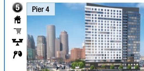
5 Pier 4

$800M, 21 acres, 3M SF of development, 2M SF of office space. Two 18-story buildings, 60,000 SF of ground floor restaurant and retail. Future headquarters of Vertex Pharmaceuticals. Developer: Fallon Company