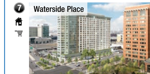
7 Waterside Place

$62M, 197,000 SF, 2 buildings, 197 residential units. Developer: Cresset Development