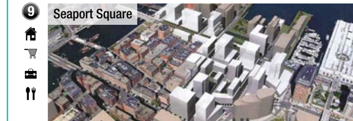
9 Seaport Square

6.5M SF 2.5M SF residential space 1.5M SF new office space 2 hotels 1.5M SF of multi-level retail / restaurant / entertainment Cultural and educational center Developer: Boston Global Investors (BGI)