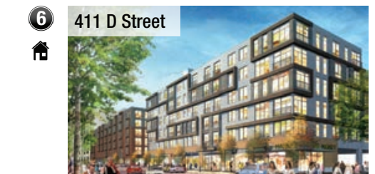
6 411 D Street

315,000 SF hotel, 625,000 SF residential, and civic and retail space. Developer: New England Development