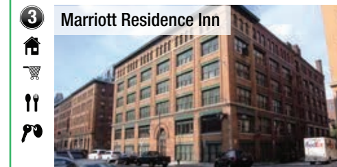
3 Marriott Residence Inn

Factory 63 Factory 63: 173,000 SF, 50+ residential units - innovation housing and artist live/work units, 18,000 SF retail/restaurant. Developer: Gerding Edlen Development 51 Melcher St: 95,000 SF office. Developer: Synergy