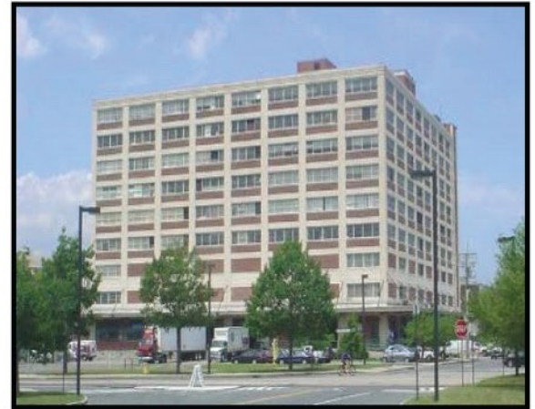
12 Channel St Building