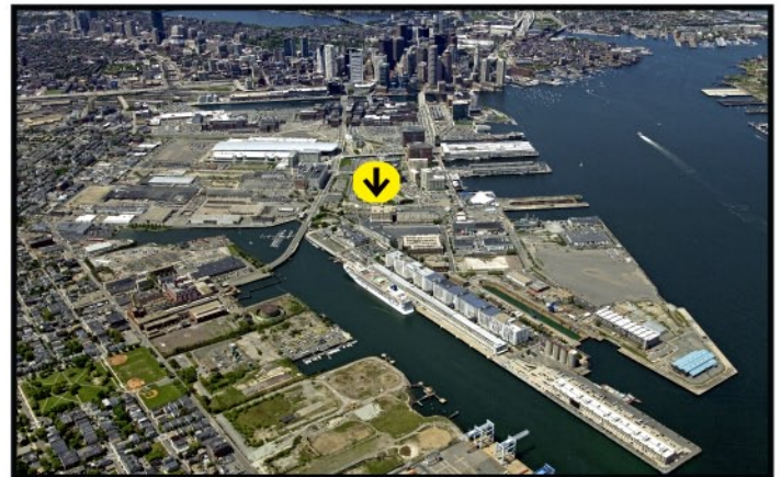
Boston Marine Industrial Park

For additional information or to schedule a tour, please contact: