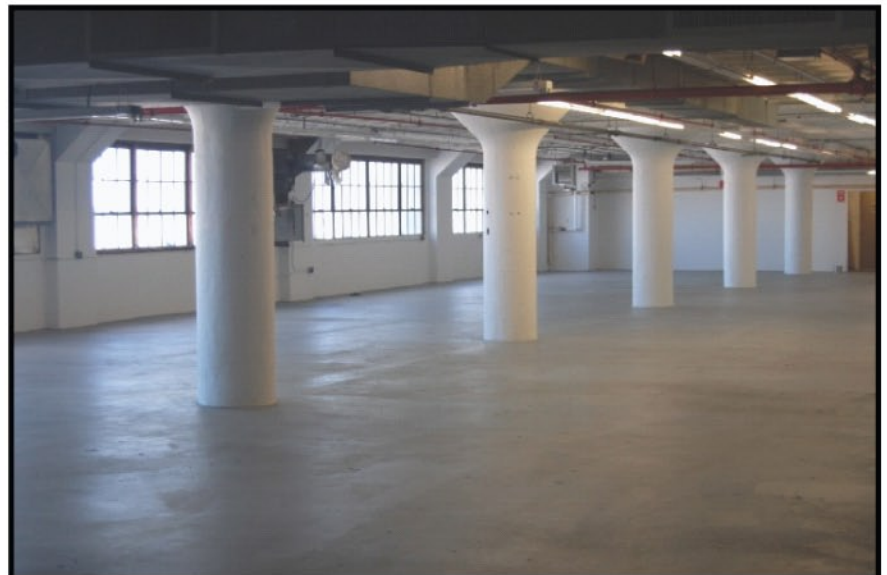
Interior View, Suite 503