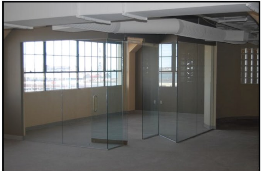
Interior View, Suite 605