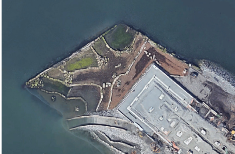
New intertidal flats, salt marsh and coastal banks with access