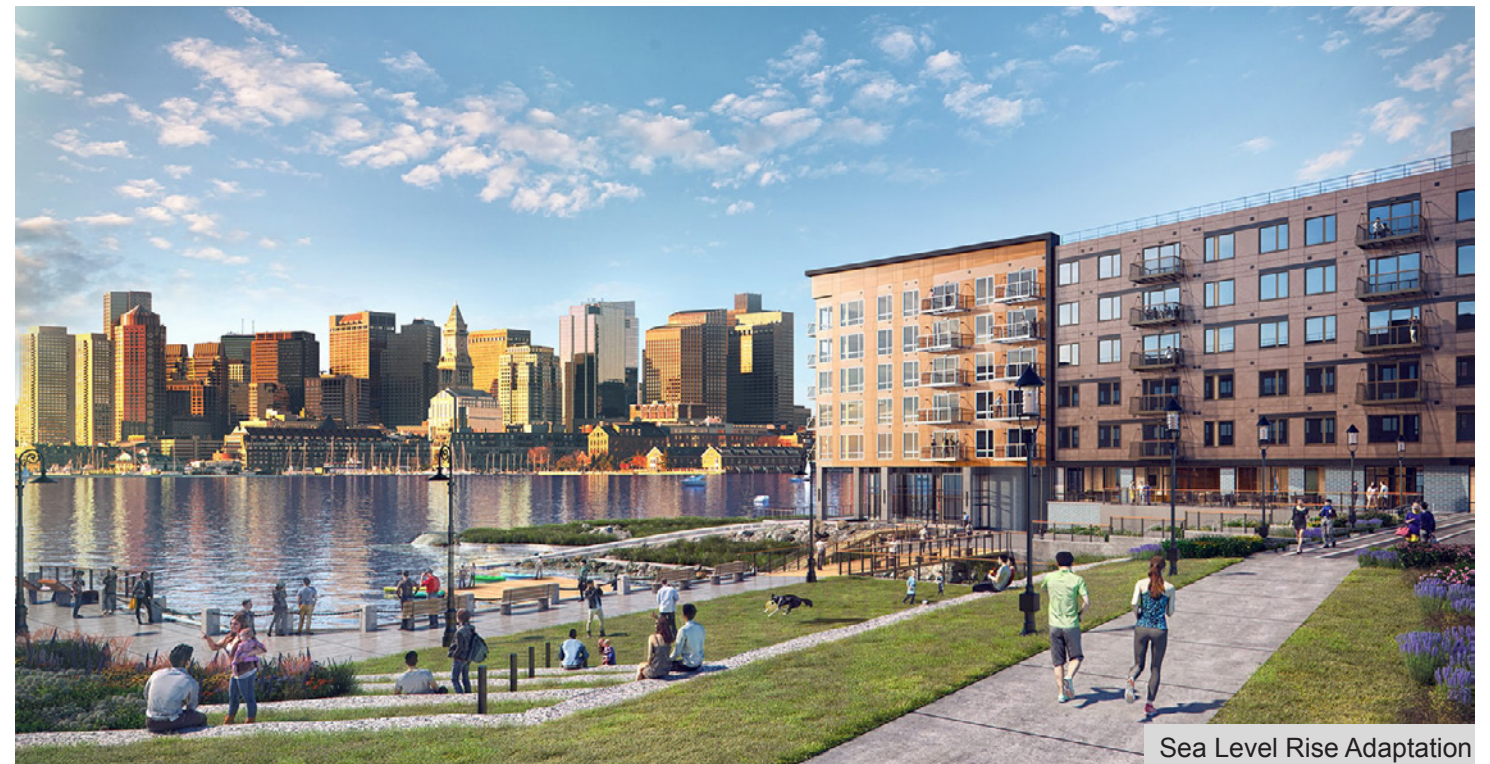
Sea Level Rise Adaptation