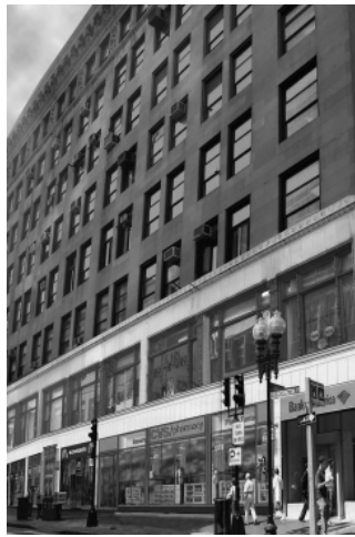
After view (rendering by BRA)

Facade and interior improvements are happening at the beautiful 1922 Art Deco building located at 333 Washington Street in Downtown Crossing. There are presently 125 stores in the building, primarily wholesale and retail jewelers, with some other uses such as beauty salons, importers, and the eatery Chacarero on Province Street.