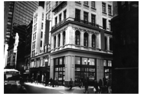
Site at Proposed Dorm at 10 West Street

Some of the most exciting events over the past century have included the construction of new facilities in the downtown crossing area. During the