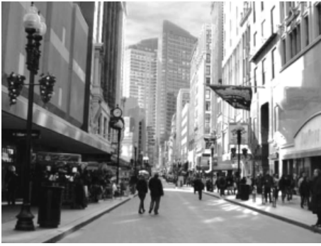
Before: Washington Street