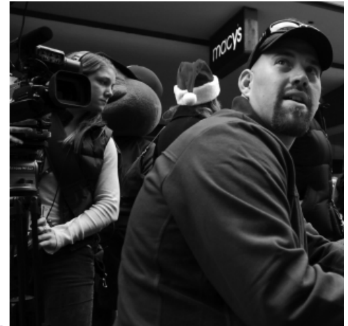
Kevin Youkilis greets Red Sox fans