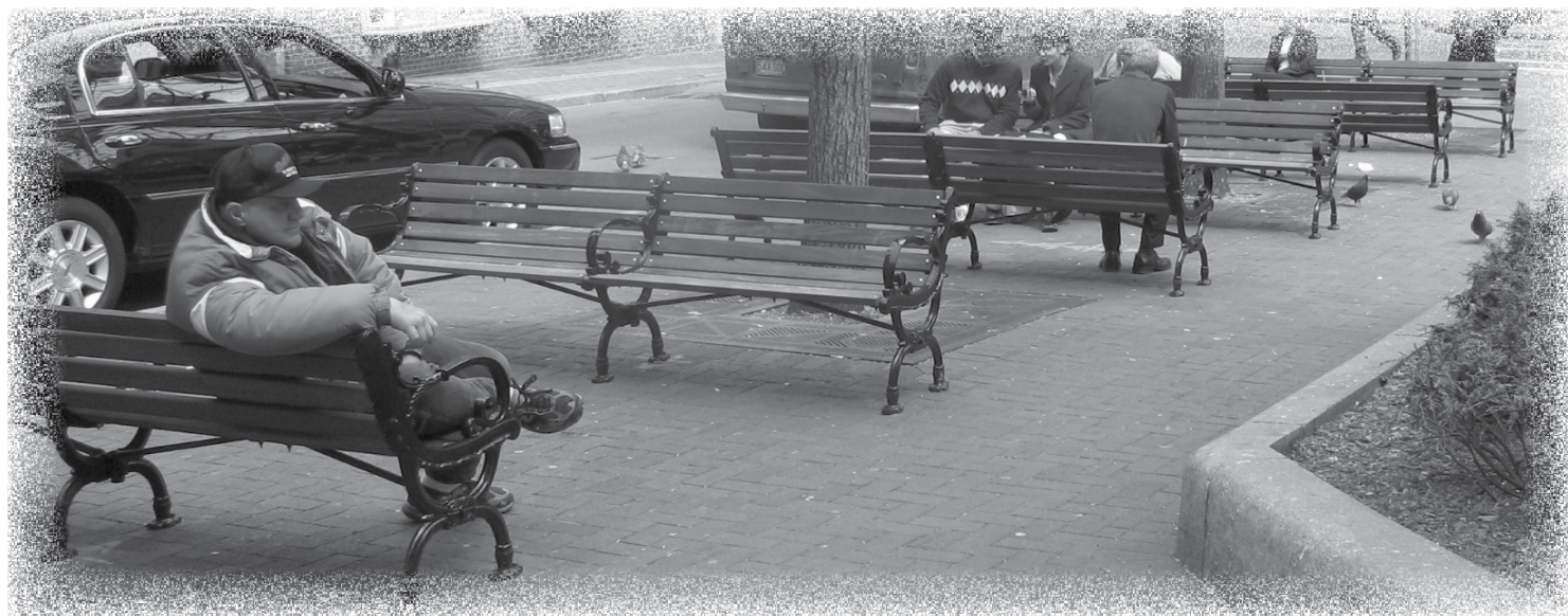
New benches in Readers' Park next to Borders