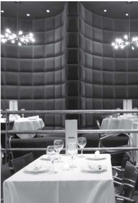
Dining room at Felt

Who says you can't find a place to eat in Downtown after 5:00 PM? Check out these two great restaurants highlighted in our inaugural "Dining in Downtown" section. Each upcoming edition of the Downtown Crossing News will feature several Downtown Crossing eateries.