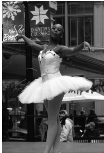
Dancer from “Urban Nutcracker”