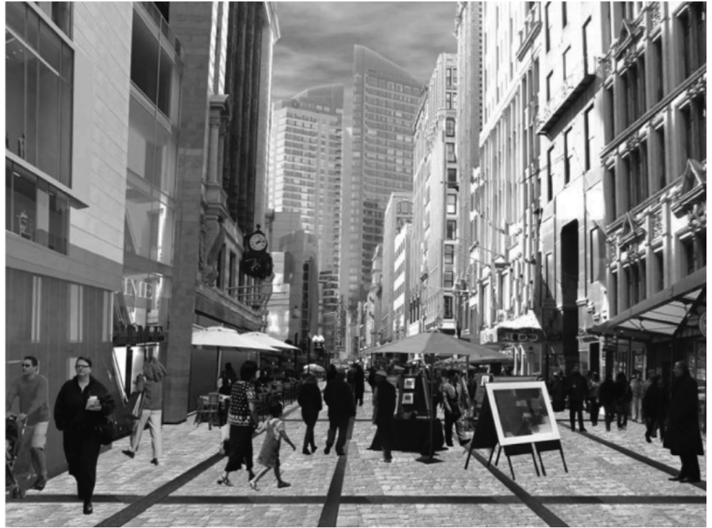
After: A view of Washington Street with removal of curbs and improved pedestrian area

The pedestrian model was created to understand how pedestrian and shopper activity will be affected by changes to the street and sidewalks. The model estimates the number of people walking along each sidewalk throughout the day and especially during the lunch time peak period and then indicates which streets and sidewalks exhibit the greatest and lowest levels of pedestrian activity. The model also identifies key streets for everyday walking trips and helps to target improvements to the locations of greatest impact. The proposed changes to the area, including removing the curbs along Washington Street and reconfiguring the pedestrian zone, can be modeled to show the impact to the streetscape and businesses in the area. This testing can be beneficial at the early stage of the design process to provide a cost-effective analysis of how the new layout will perform as well as give an early indication of how people will adapt to and use the reconfigured streets and sidewalks.