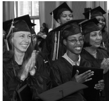
Recent Urban College graduates

URBAN COLLEGE is a small, private two-year college located in Downtown Boston. Since receiving its charter in 1993, it has served a population of non-traditional, low-income urban students. Most of the 800 students are women, working full time during the day, single parents, raising a family and going to school in the evenings. Courses are taught in three languages – English, Spanish and Cantonese. The main location is the upper floors at 178 Tremont Street, but space is also rented