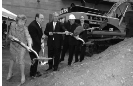
Mayor Menino and President Jacqueline Liebergott at a recent groundbreaking

at 200 Tremont Street, 112 Shawmut Avenue, 19 Temple Street and 105 Chauncy Street. By 2010, Urban College would like to expand to 1,000 students and will require 14,000 square feet of designed classroom, laboratory, and support services space. www.urbancollege.edu