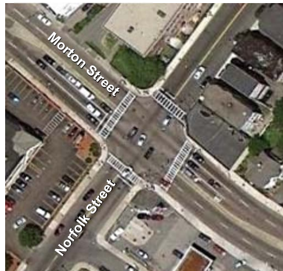
Morton and Norfolk streets

There were 46 crashes, including one involving a pedestrian and one involving a bicyclist, at the intersection of Morton Street and Norfolk Street, which is located one block northwest of the Morton Street Station. Morton Street at Norfolk Street is the busiest intersection of the four discussed. During the AM peak hour, 690 vehicles approach from the west, 260 from the north, 400 from the south, and 1,125 from the east. There are a significant number of trucks, and 11.5% of the total approaching vehicles are making left turns.