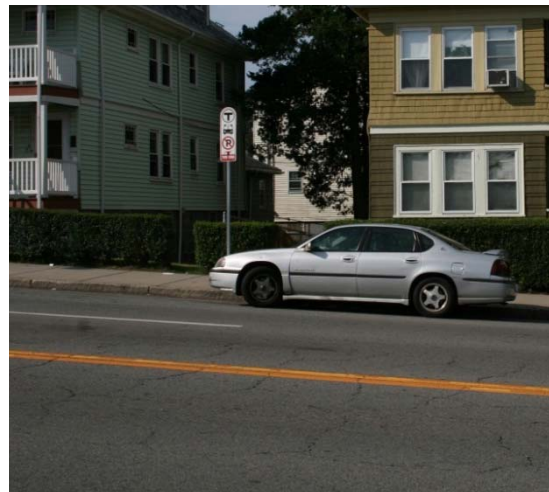
Morton and Fuller streets: Midblock bus stop with no crosswalk

The most dangerous circumstance at this intersection is the presence of a pair of MBTA bus stops on each side of Morton Street at Owen Street, 140 feet east of Fuller Street and also lacking a marked crosswalk over Morton Street. While use of an unmarked crosswalk is permitted, this would be a less-safe option for crossing Morton Street, especially if pedestrians are rushing to catch an approaching bus. Pedestrian traffic in this area, transit related and otherwise, would probably not warrant the installation of a marked crosswalk.