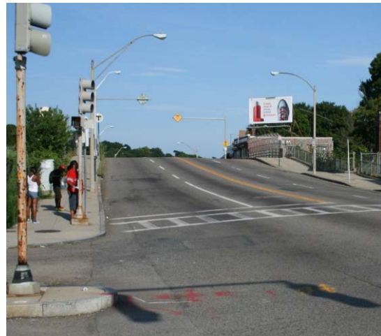
Morton and Evans streets: Wide ROW to accommodate bike lanes

Sidewalks, ramps, and crosswalks are in good condition, although one ramp has collected substantial debris. As at Norfolk Street, the pedestrian signals are problematic. Three corners have audible buttons, and one corner has an old-style button. The audible buttons tell when to walk, but are currently programmed for a quiet hum rather than the more intrusive chirp, despite having commercial uses on all four corners. Also, the pedestrian phase has been programmed to occur automatically every cycle, despite few pedestrians crossing. This loss of green time on Morton Street may exacerbate the practice of hurried driving. The pedestrian signal timing is 20 seconds, which is sufficient for the lengths of crossings at this intersection.