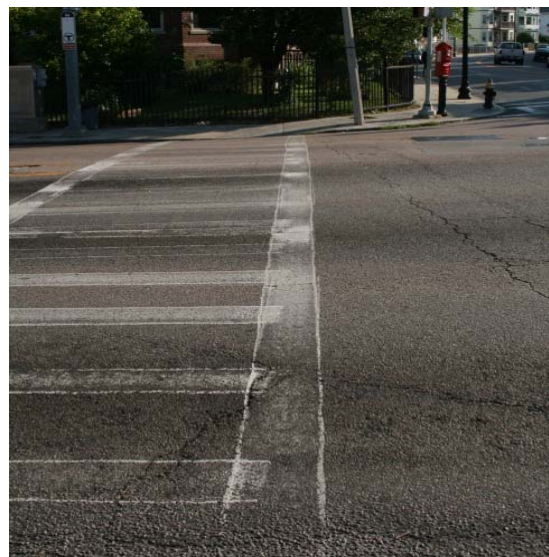
Faded crosswalk at intersection of Morton and Norfolk streets

There were 36 crashes, including two involving pedestrians, at the intersection of Morton Street and Evans Street, which is located northeast of the Morton Street Station.