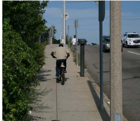
Morton Street: Bicyclist riding on sidewalk