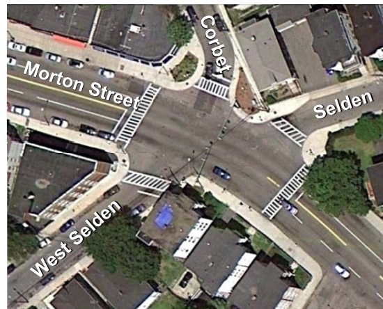
Morton, Corbet, Selden, and West Selden streets

There were 13 crashes, including one involving a pedestrian and one involving a bicyclist, at the intersection of Morton Street with Corbet, Selden, and West Selden Streets, which is located approximately two blocks southeast of Morton Street Station. This is a five-way intersection, though traffic only approaches from four directions. West Selden Street is a two-way street that approaches Morton Street from the south. Selden and Corbet Streets are one-way streets north of Morton Street, directly opposite West Selden Street. Northbound traffic on West Selden Street can continue north onto the one-way Selden Street. Southbound traffic on Corbet Street can cross Morton Street and continue south on West Selden Street.