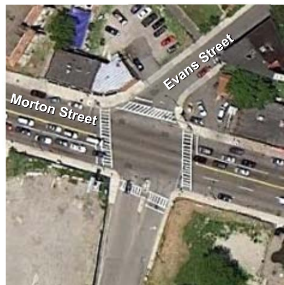
Morton and Evans streets