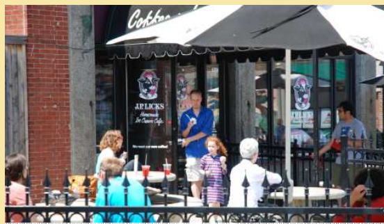
Wider sidewalks allow for opportunities for outdoor café seating, enlivening the street.