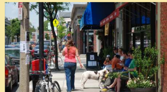
Active sidewalks reflect the vitality of the Centre-South corridor and its restaurants.