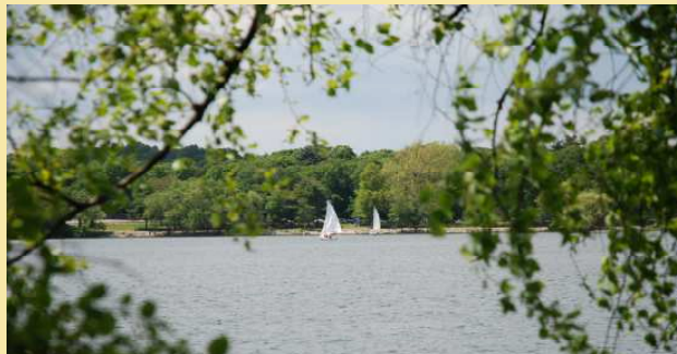
The corridor provides links to public open space along Centre and South streets and the nearby network of regional open spaces.