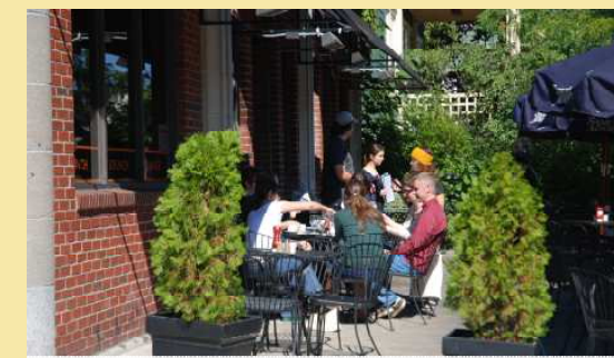
Finding opportunities for additional sidewalk space is an important component of the vision.