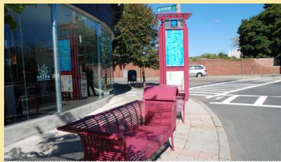
Bright colors and storefronts with high transparency add interest to the sidewalk environment.