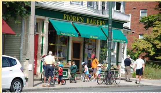
The popularity of the stores and services along the corridor require an enhanced pedestrian network.