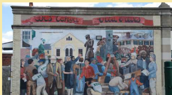
Murals combined with the other public art and historic structures, offer the foundation for an "arts and culture walks".