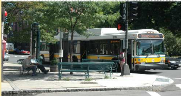
Bus service offers connections to the wide range of goods and services along the corridor and to subway service.