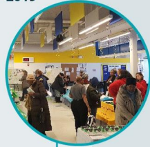
Envisioning Your Neighborhood 12/10