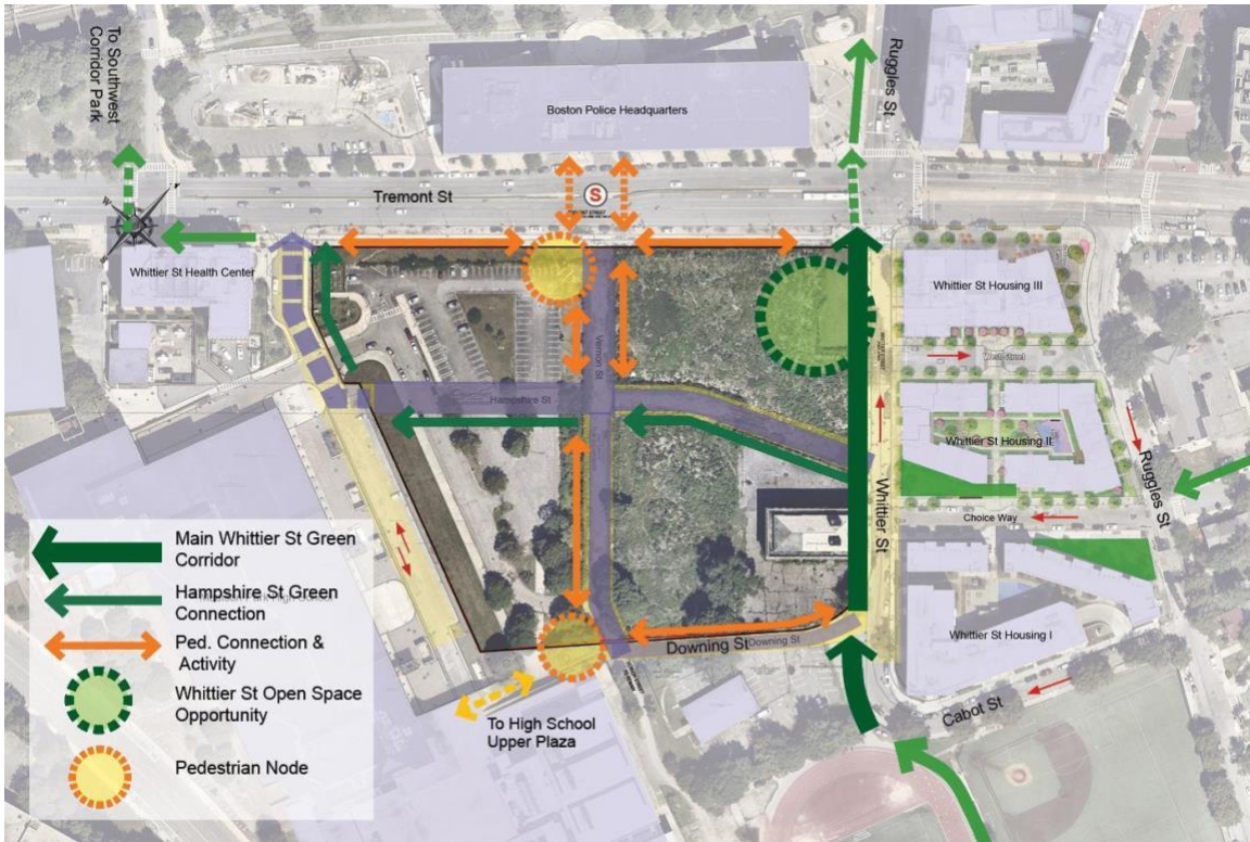
Figure: Open Space & Pedestrian Connectivity