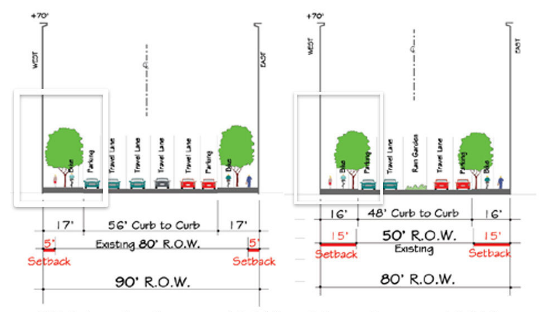
Old Colony Ave Conceptual R.O.W. D Street Conceptual R.O.W.

Consider separation of bikes and pedestrians with tree on D Street as shown for Old Colony.