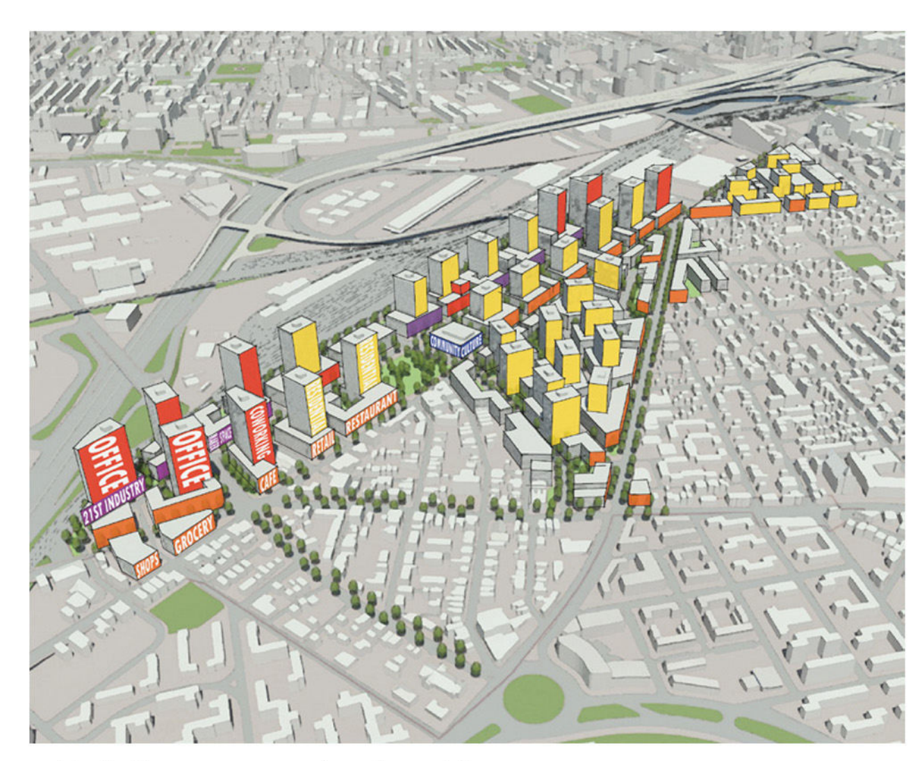
Draft Plan as presented to the public