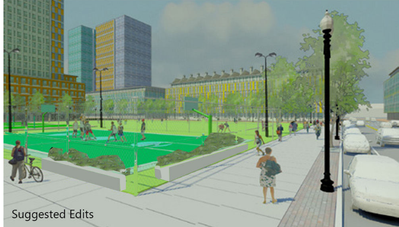
Edit image for 'Active Large Open Space' to show pedestrian access with a low seating wall and plantings along the sidewalkinstead of chain link fence.