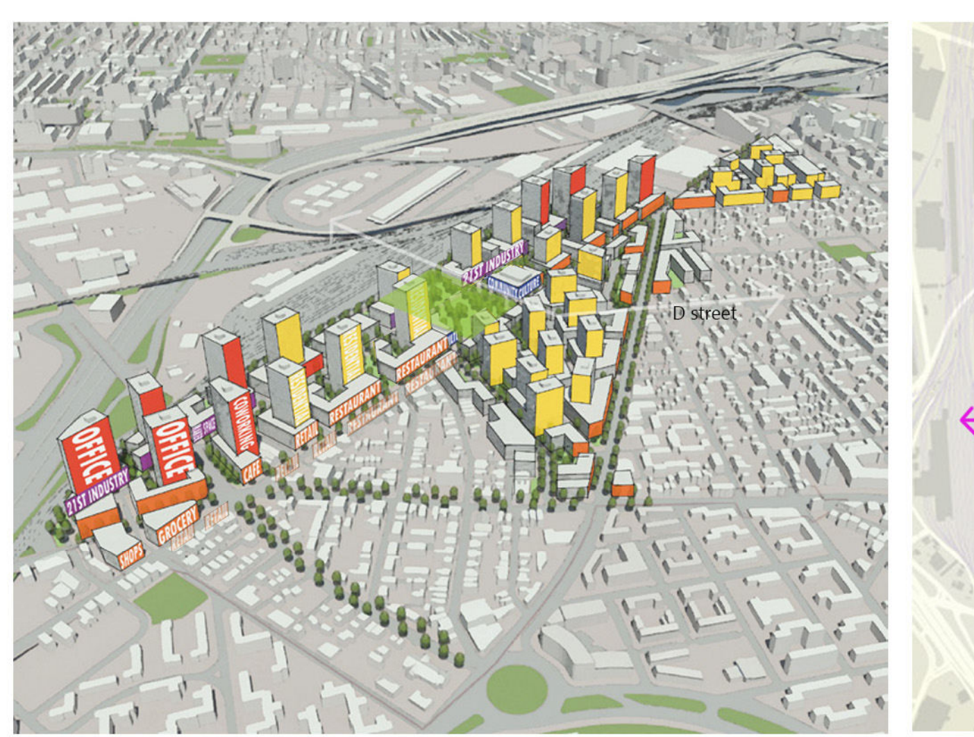
Suggested Edits (composite of all suggestions shown here in perspective and plan views).