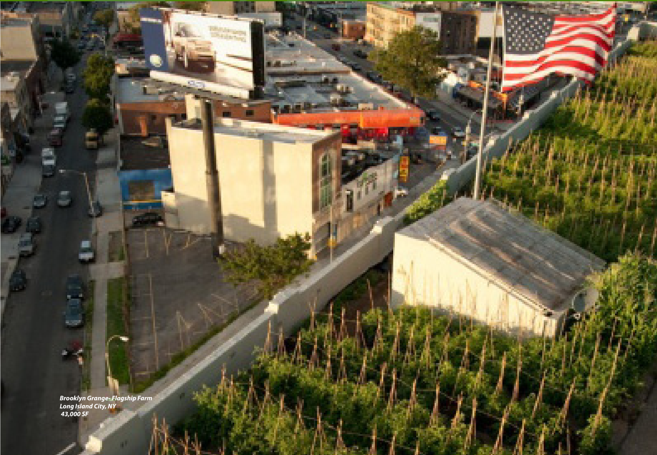
Brooklyn Grange-Flagship Farm Long Island City, NY 43,000 SF