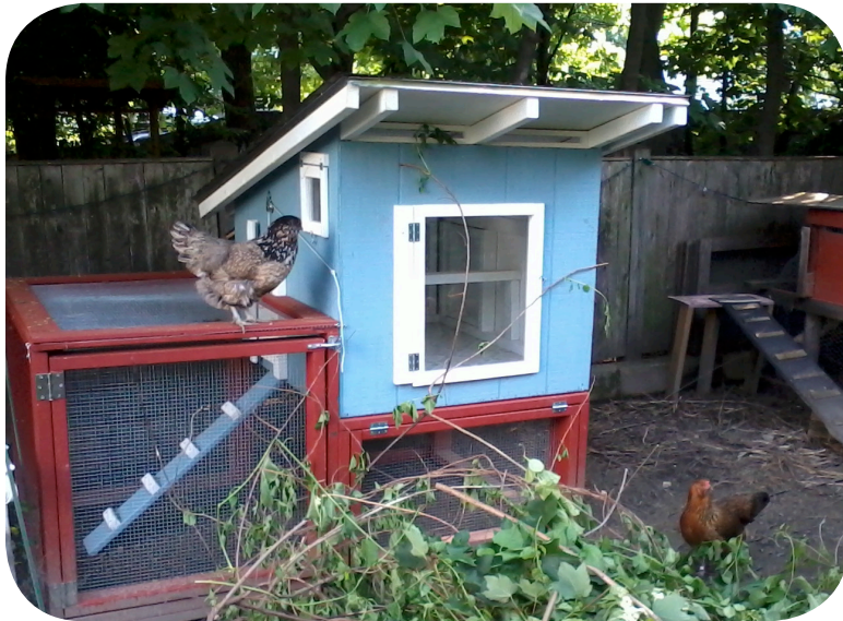
A local coop in Somerville, MA

A COOP is an enclosed shelter in which a chicken lives. See Article 89, Section 9 for guidelines for chicken coops.