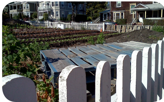
Fencing will be reviewed under CFR