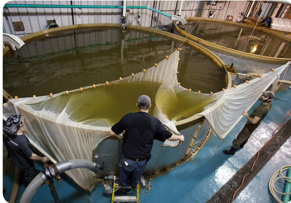
Aquaculture facility cultivating barramundi (Asian seabass) Australis - Turner Falls, MA

Aquaponics uses natural processes to convert fish waste to nutrients for plant growth. In addition to all the benefits of aquaculture and hydroponics, aquaponics has the advantage of a self-filtering cycle that requires less water, produces less wastewater, and reduces maintenance and cleaning.