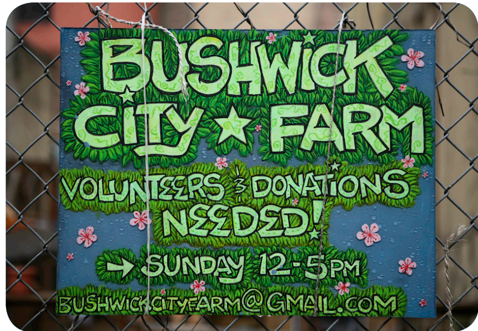
Urban farm sign that meets the requirements of Article 89

Farms may apply for more signage than what is required or allowed in Article 89 (e.g., more than one sign, larger dimensions). BRA review of this additional signage will occur either under Comprehensive Farm Review (see Chapter 3 of this document), or if the farm is not undergoing CFR, through an administrative BRA staff level review called Comprehensive Sign Design Review.