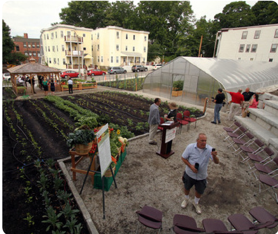
ReVision Urban Farm - Victory Programs, Dorchester, MA Half-acre in size

Farms should be well-maintained in healthy growing condition, especially in the off-season. Farms should try to use indoor storage for materials and supplies and parking should not be visible from the public way if possible.