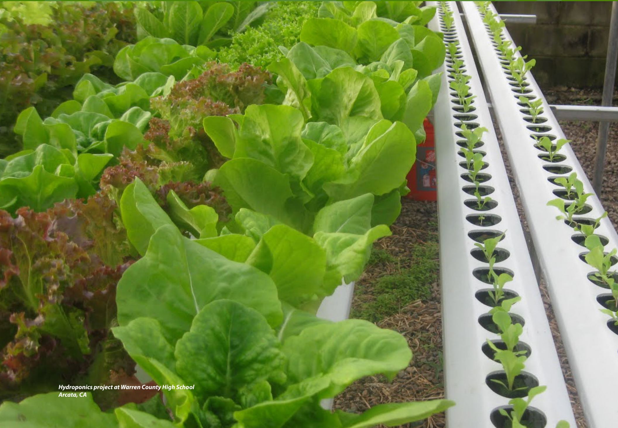
Hydroponics project at Warren County High School Arcata, CA