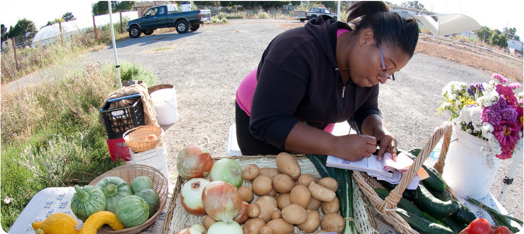
Farm stands are allowed where urban farms are allowed