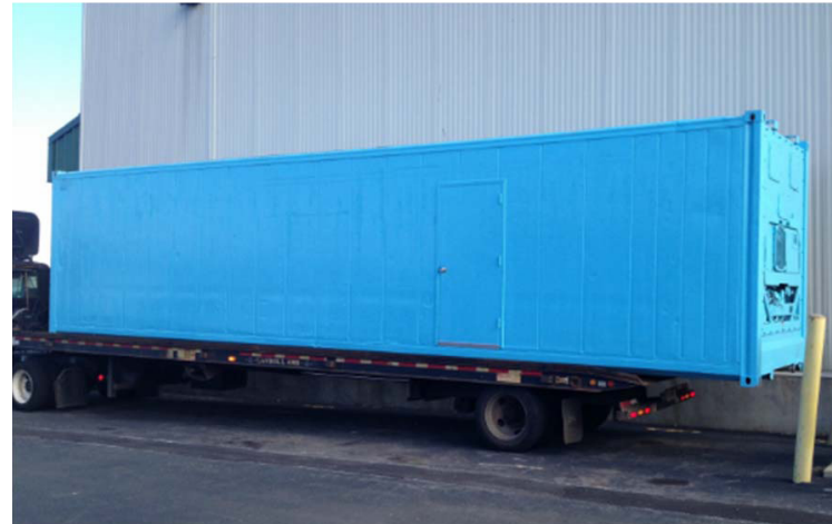
Typical freight container (40 ft x 8 ft )

The “Farming Practices” section of this Guide (under “hydroponics” and “aquaponics”) describes how Article 89 deals with freight container farming. For use regulations for freight container farming, see Article 89, section 11(1) and (2). For design review requirements, see Section Article 89, Section 11(4).