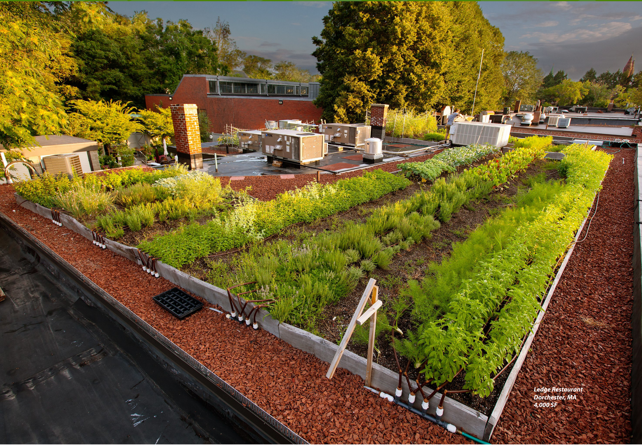
Ledge Restaurant Dorchester, MA 4,000 SF