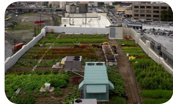
The layout of this roof-level open air urban farm would be reviewed under CFR