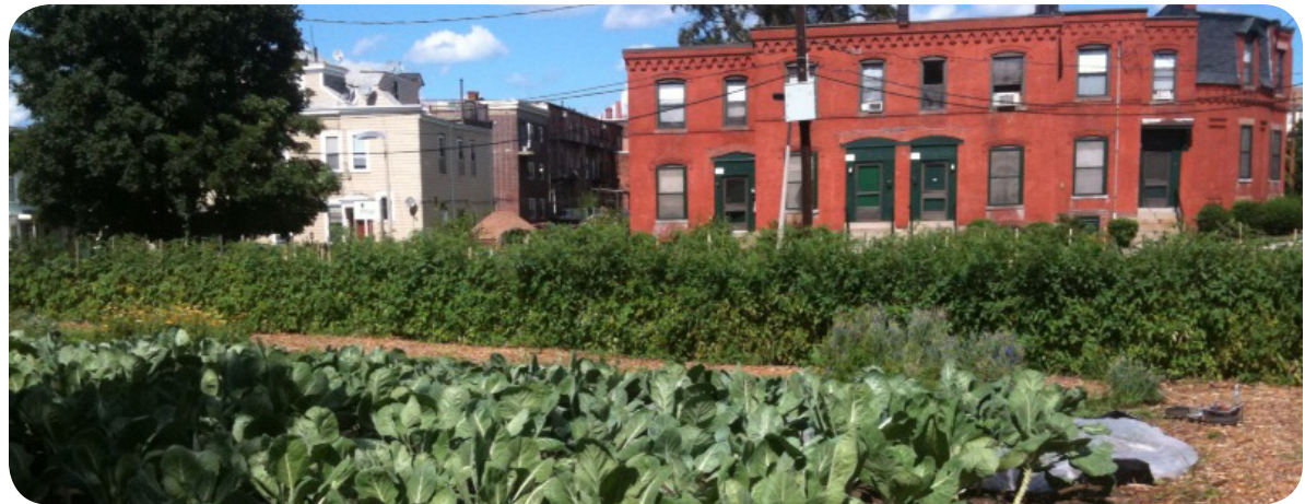
The Food Project's Ground-Level Urban Farm in Roxbury, MA

For details of zoning for ground-level farms, see Section 89-4.