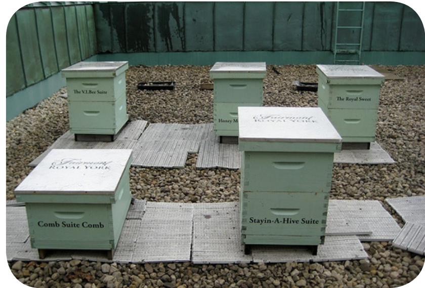
Rooftop hives on the Fairmount Royal York Hotel Toronto, Canada

A COOP is an enclosed shelter in which a chicken lives. See Article 89, Section 9 for guidelines for chicken coops.