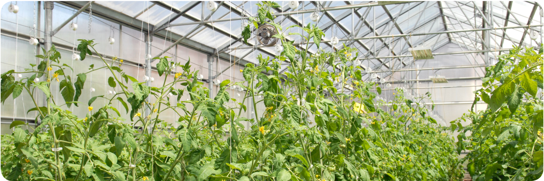
Tomatoes growing in the Food Project's Greenhouse in Roxbury, MA

Article 89 allows farming in different parts of the city based on the underlying zoning districts, the size of the proposed farm, and the nature of its operations. In many cases, Article 89 allows farming outright, meaning no public hearings are required, although special permits and/or administrative reviews may be required by other city affiliates (i.e., Boston Landmarks Commission,