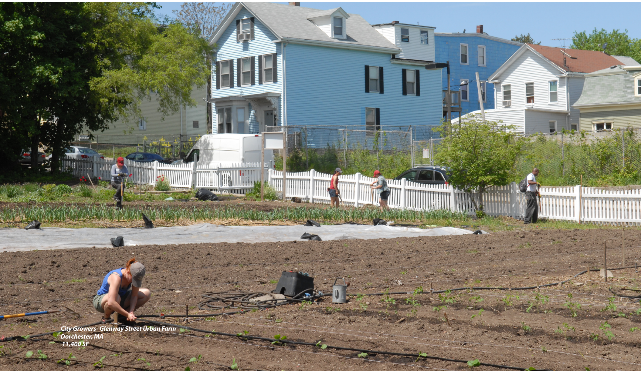
City Growers - Glenway Street Urban Farm Dorchester, MA 11,400 SF