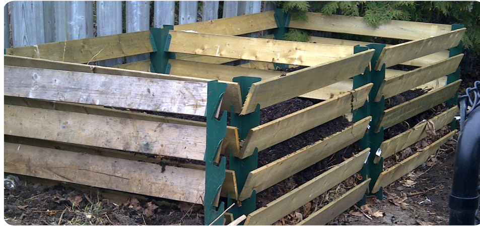
A well-maintained ground-level composting bin

Farmers must carefully manage their composting to avoid creating nuisances for themselves and their neighbors. By following the composting requirements of Article 89, state regulations and several best practices, farmers in Boston can create more fertile growing environments while avoiding odors and pests.