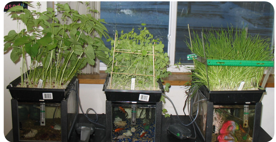
An accessory aquaponics system up to 750 SF would be allowed in all residential zoning districts

Aquaculture and aquaponics facilities as an accessory use up to 750 square feet are allowed in all districts*, with the exception of those cultivated in freight containers, to which more restrictive use regulations apply especially in the more sensitive residential and mixed-use zoning districts (see table next page). Aquaculture and aquaponics facilities as an accessory use larger than 750 square feet are allowed in industrial, institutional and large scale commercial districts, and are conditional in small scale commercial and residential districts, with the exception of those cultivated in freight containers, to which more restrictive use regulations apply for the same reason mentioned above (see table next page).