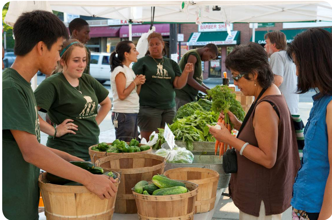
Farmers' Market in Boston, MA

Under Article 89, farmers' markets are a defined use and are allowed anywhere in the city where a retail use is allowed by the underlying zoning. Otherwise, they are a conditional use.