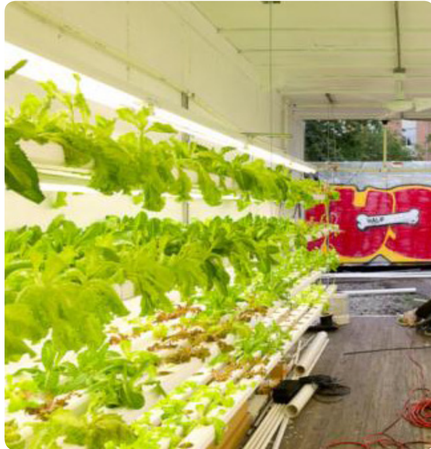
Produce growing hydroponically in a freight container PodPonics - Atlanta, GA

Properly disposing of water that may contain waste matter, pesticides, or antibiotics presents a challenge to hydroponics. Hydroponic practices must comply with relevant state and federal laws regarding water discharge.