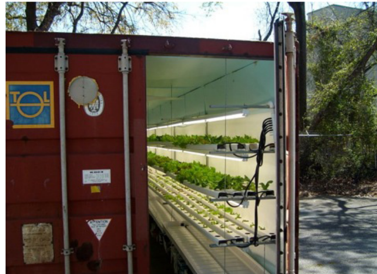
Example of produce growing in a freight container PodPonics - Atlanta, GA