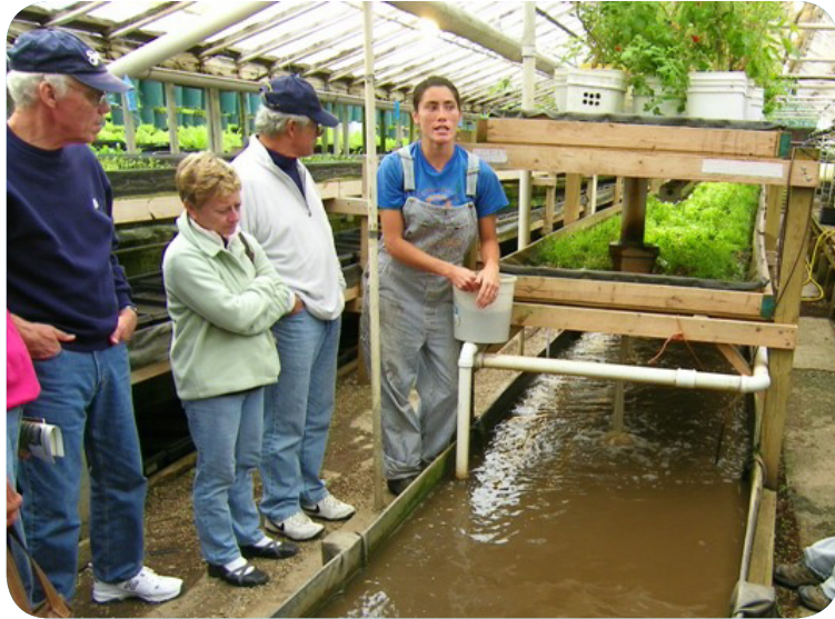
Indoor aquaponics facility at Growing Power in Milwaukee, WI