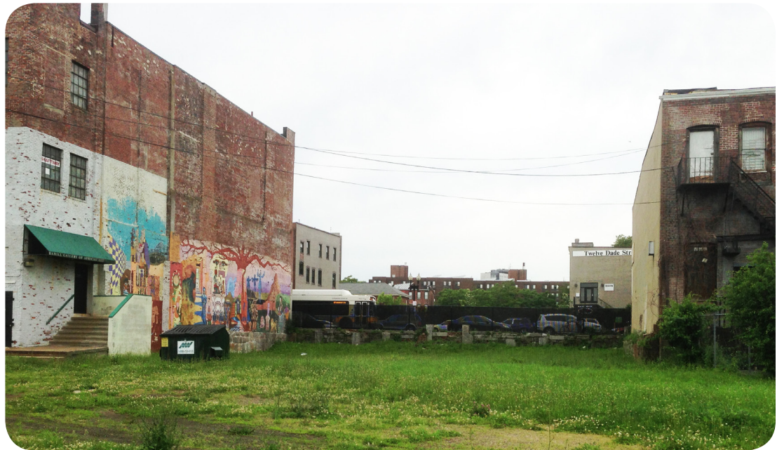
This vacant site in Roxbury is just over 10,000 square feet. A site this size would require CFR.

Article 89 requires CFR for urban farms depending on size and location within a certain type of zoning district. The threshold for CFR also depends on whether agricultural activities take place at ground level or on a rooftop. In general, Article 89 requires the least intensive review for urban farms in industrial subdistricts with no abutting residential properties or zoning districts. Alternatively, CFR will be required the most for rooftop farms and greenhouses locating in residential and small scale commercial districts due to potential visual and lighting impacts on neighbors.