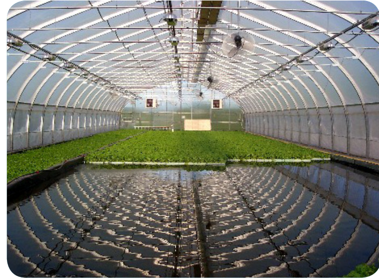
Indoor aquaponics facility