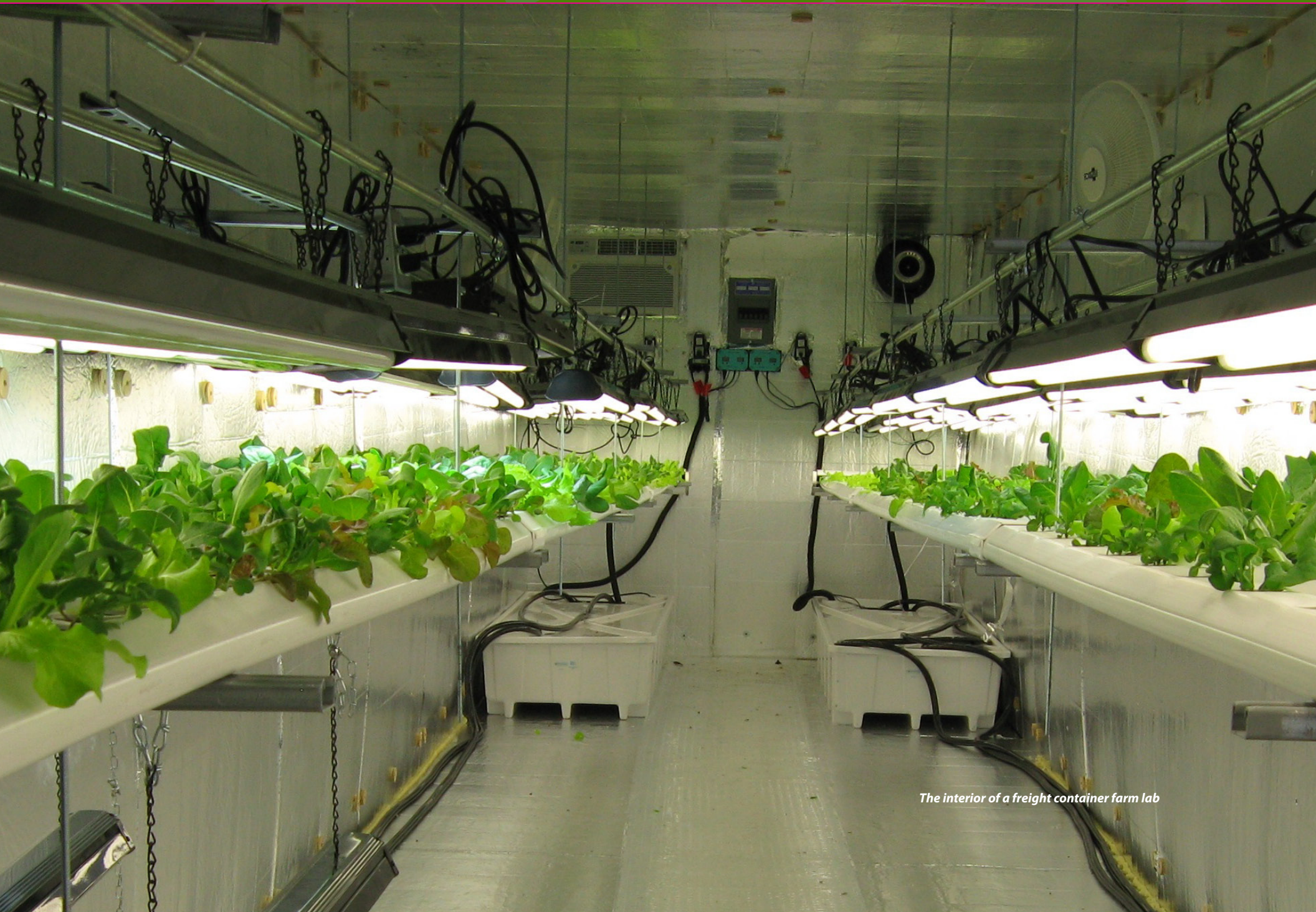
The interior of a freight container farm lab