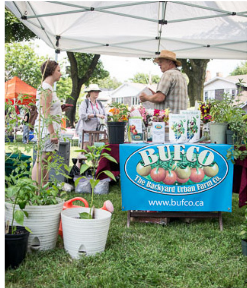
Temporary farm stand signs that meet the requirements of Article 89