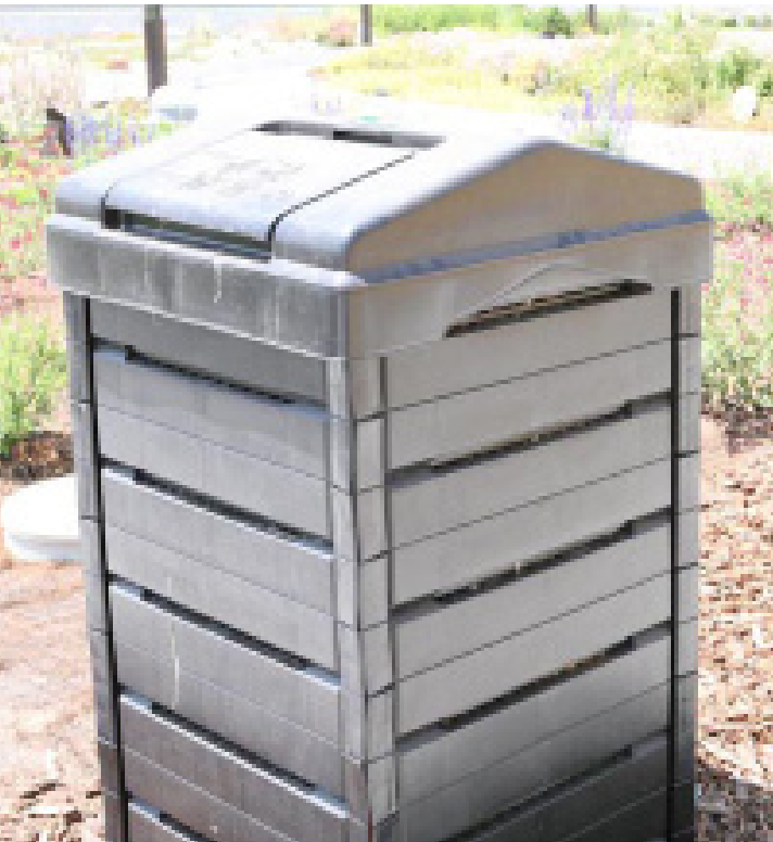
Roof-level composting must be contained within enclosed bins

Roof-level farms that practice onsite composting will use COMPOST BINS . The placement and use of compost bins is discussed in Article 89, Section 8.