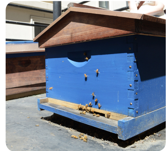
Example of a simple bee box

Setback from Adjacent Building: If the beehive is located within 20 feet of the exterior wall of an adjacent building that has walls as tall as or taller than the roof of the building in questions, a 6 foot tall flyway must be constructed (see Zoning Code for required flyway details).