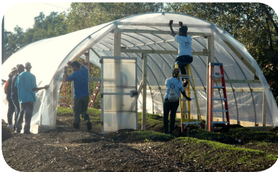
Hoophouse in construction; all farm structures will be reviewed under CFR

Greenhouses and hoophouses should be mostly transparent and secured to the ground.