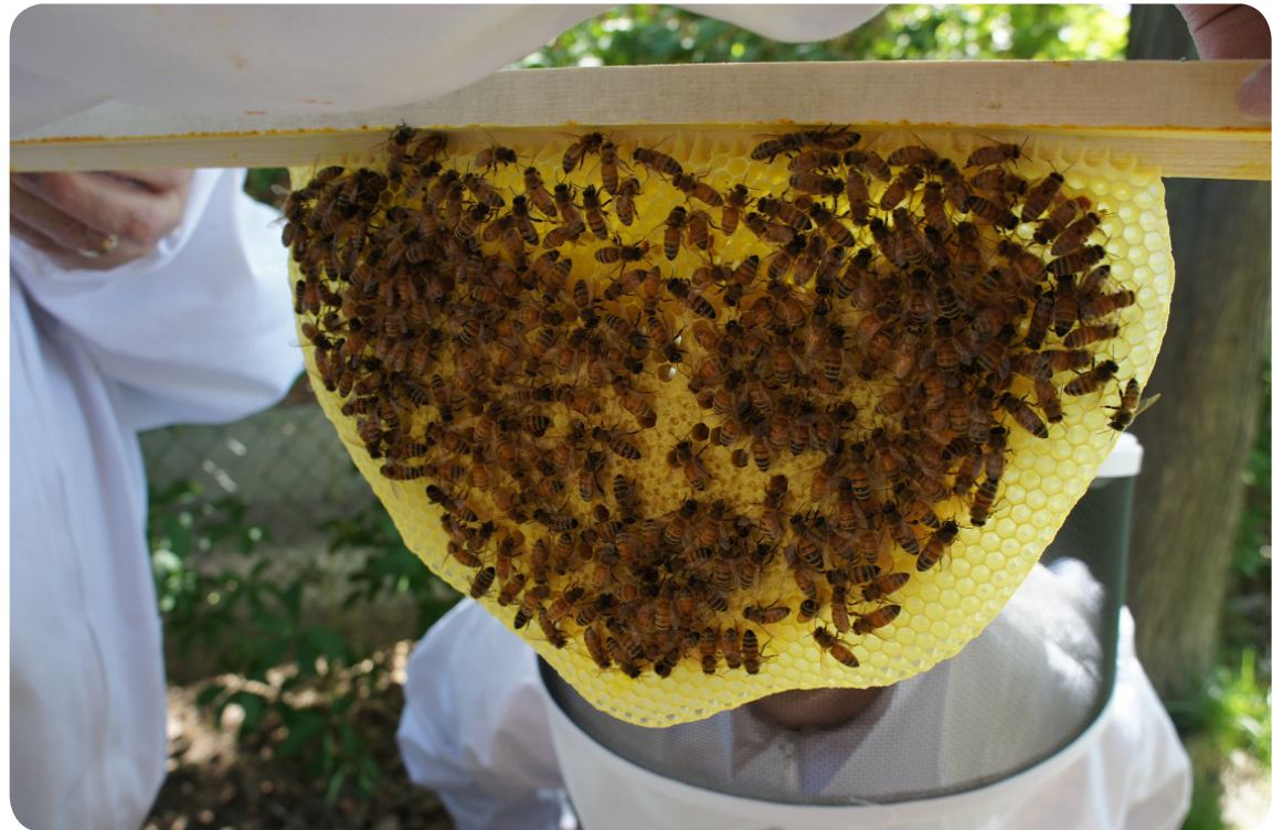
A new natural comb growing within a frame

For more details on the keeping of honey bees, see Article 89, Section 10.