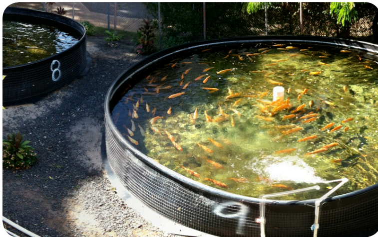
Outdoor aquaculture tanks at William McKinley High School - Honolulu, HI

As shown in the table on the next page under Article 89, aquaculture and aquaponics facilities as a primary use are allowed in industrial and waterfront commercial districts, are conditional in institutional and commercial districts (except Waterfront Commercial), and are forbidden in residential districts*.