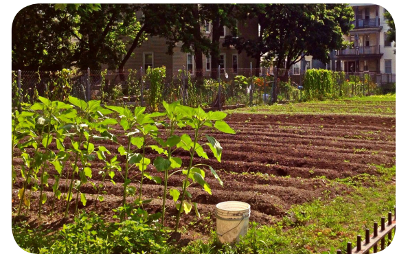
Raised beds without frames on Lucerne Street in Dorchester, MA

The Environmental Protection Agency (EPA) has adopted a Best Practice Method, known as the “Raised Bed Method,” for dealing with soil safety issues in urban environments. A raised bed is a contained volume of clean, imported soil built atop a geotextile barrier (a type of synthetic landscape fabric with selected permeability) to cover the ground surface. This barrier allows for water drainage but prevents root uptake from the contaminated soil below. This method has a proven track record of safely and effectively minimizing exposure to contaminated soil.