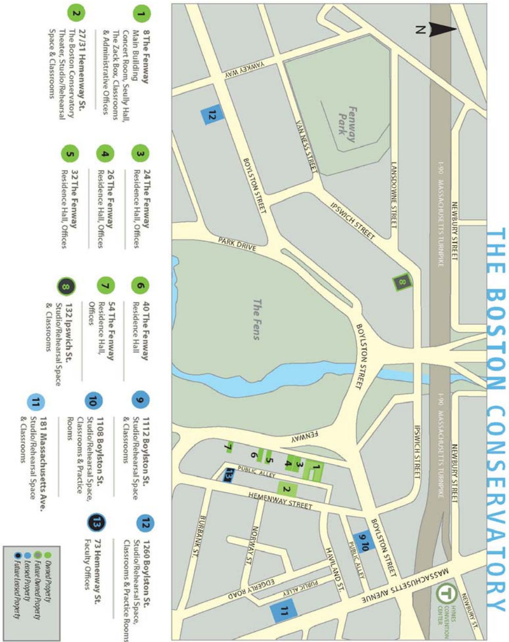
Figure 1. Campus Facilities Map