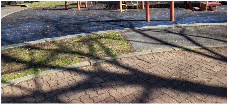
FIGURE 2: SPLASH PAD