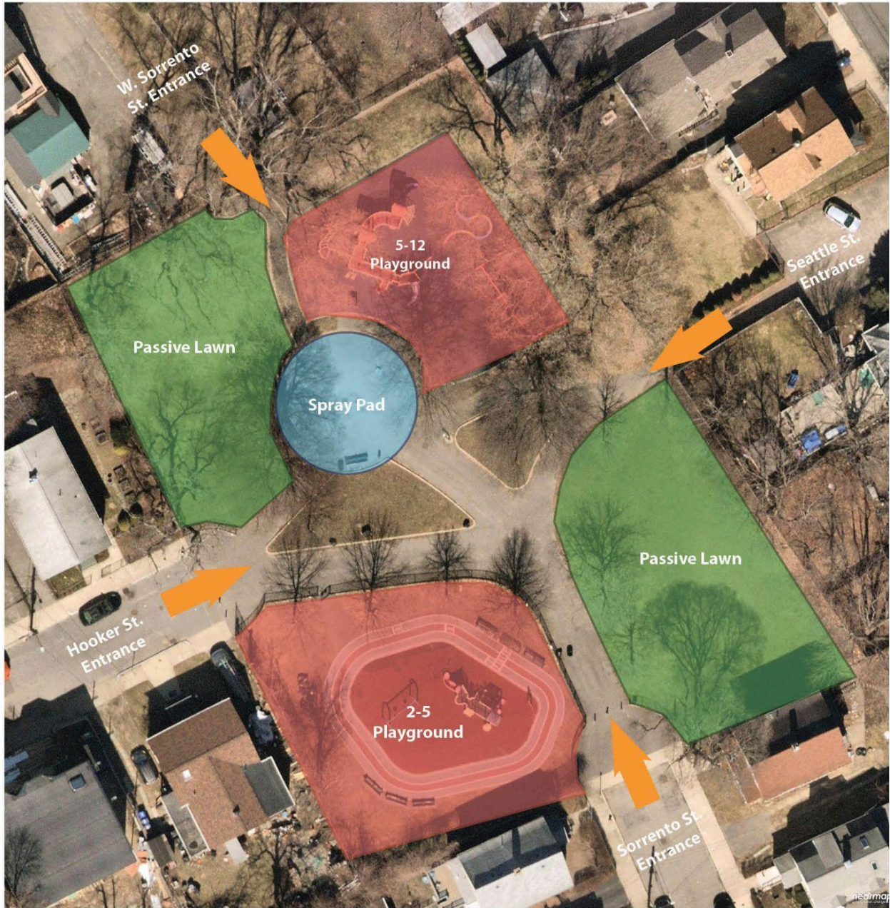
FIGURE 1: SITE FEATURES