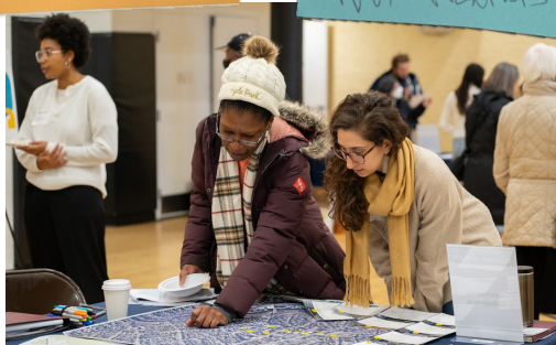
Comments from our Cleary Square kick-off event.