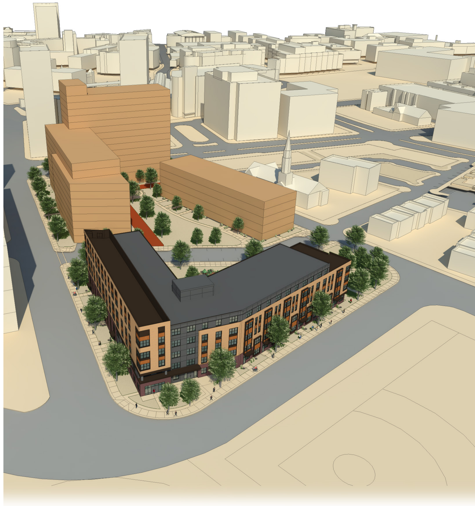
June 2015 Design