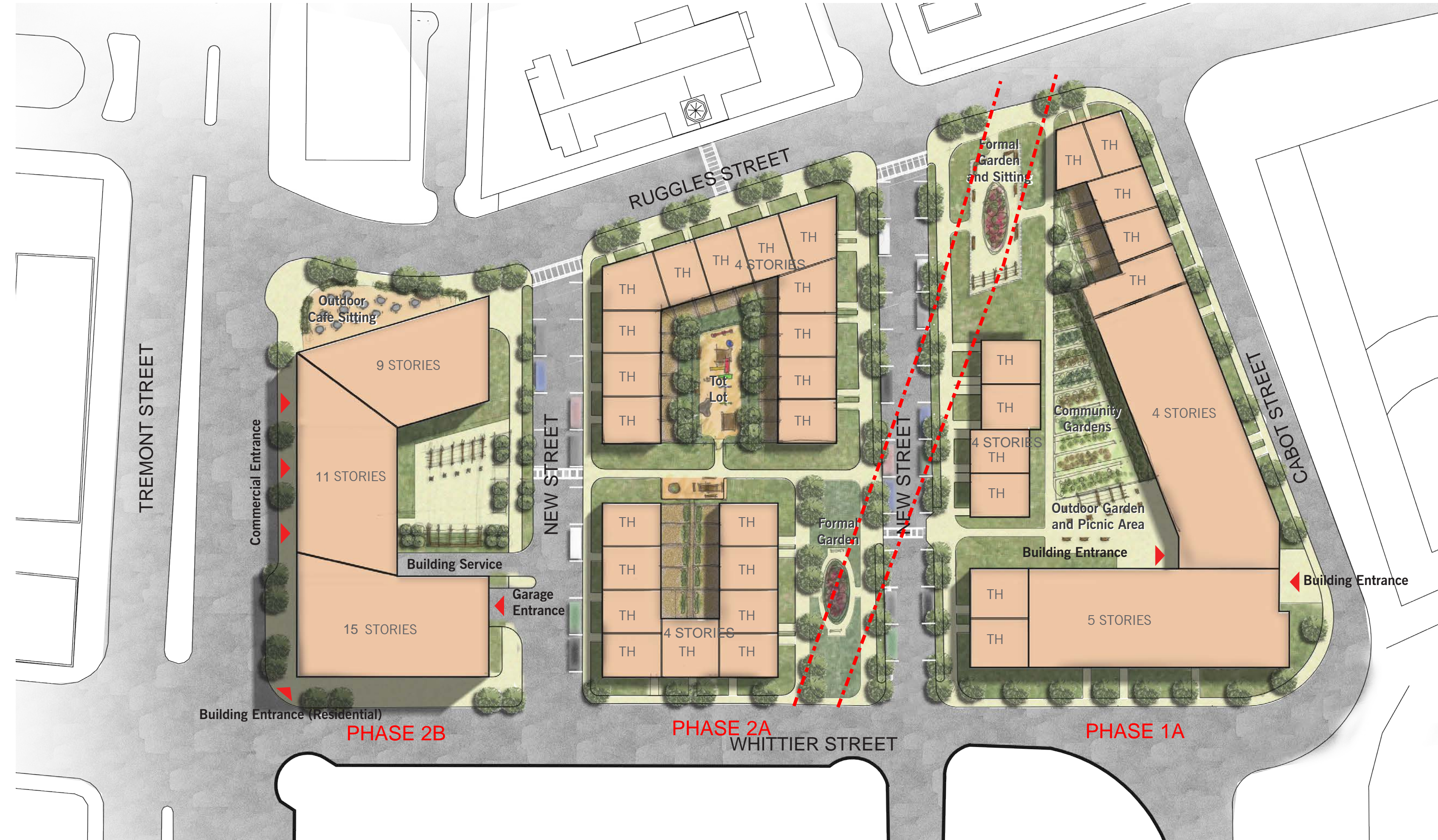
2017 Site Plan