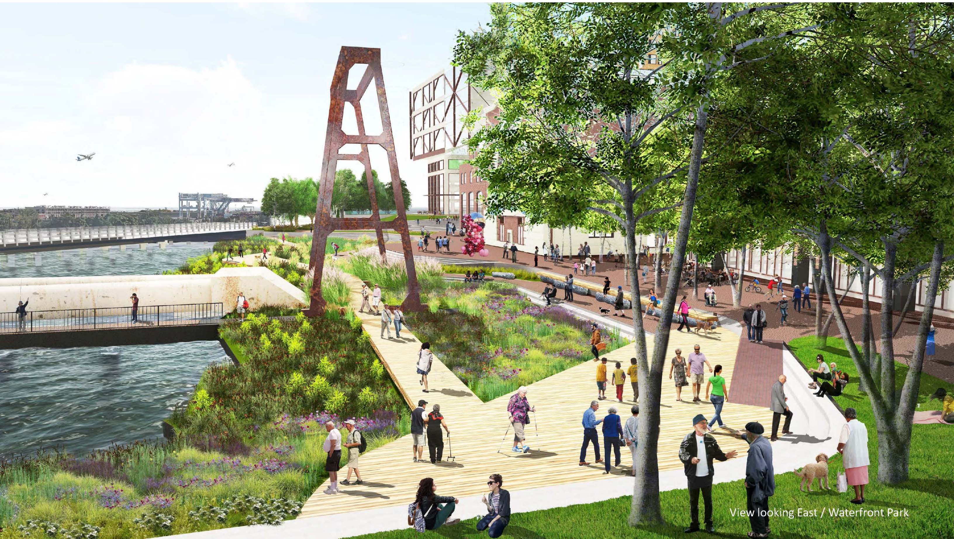
View looking East / Waterfront Park