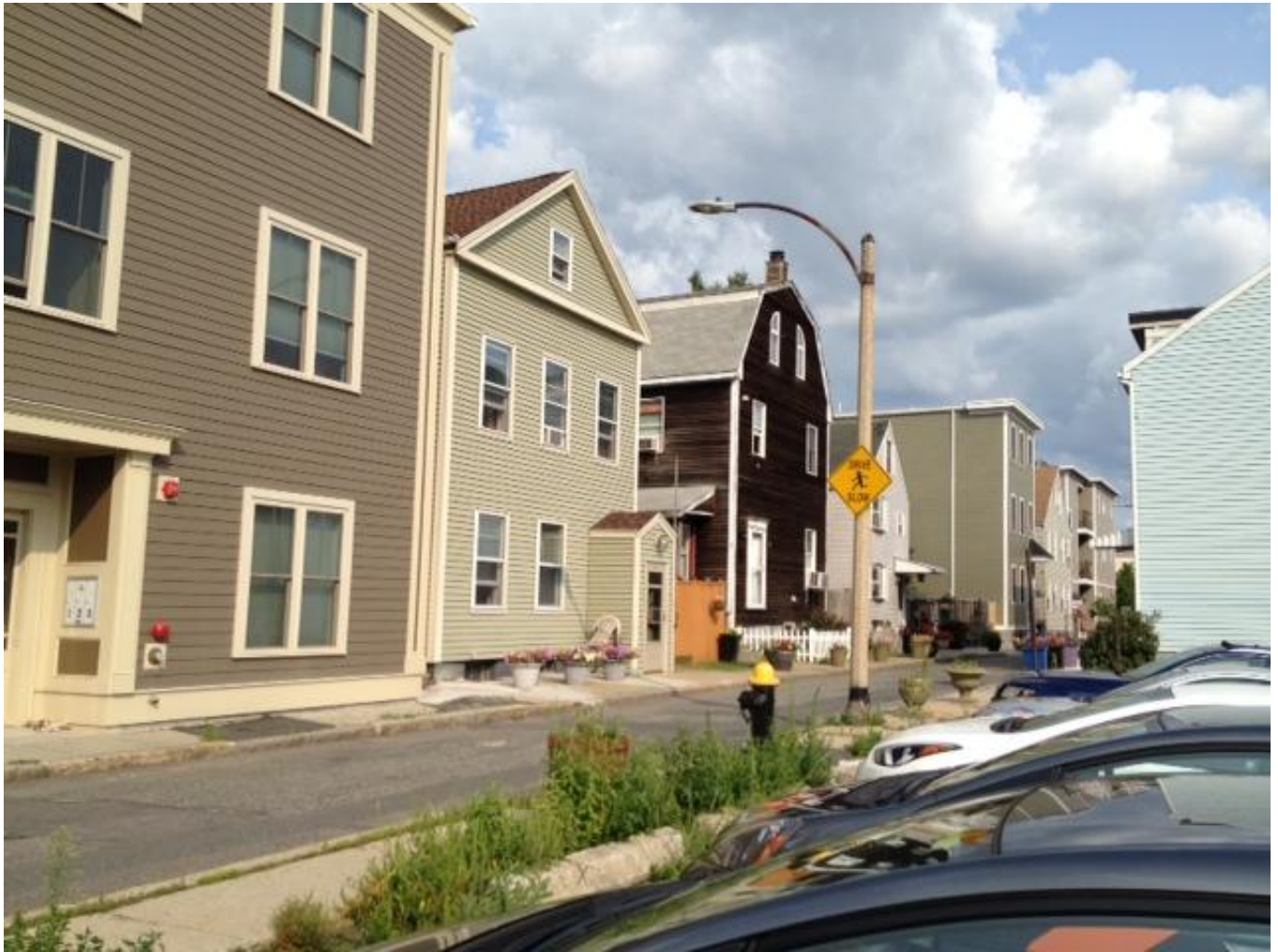
View from site, showing residences across Athens Street