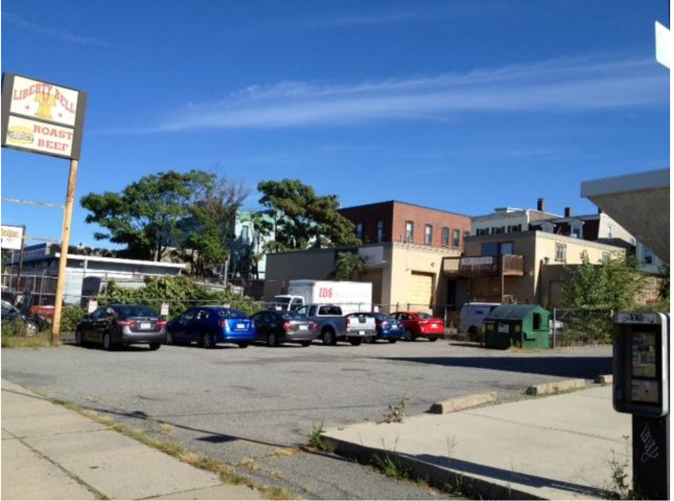
View of site from West Broadway, looking northwest