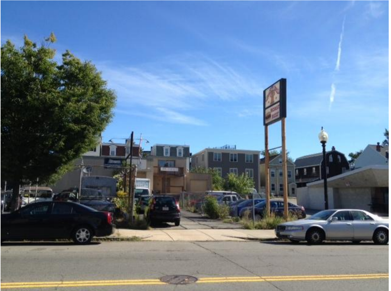
View of site from West Broadway – Liberty Bell to the right