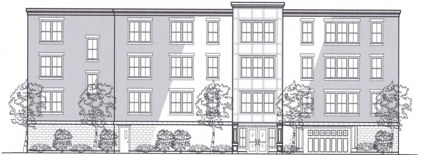
FRONT ELEVATION @ WEST BROADWAY