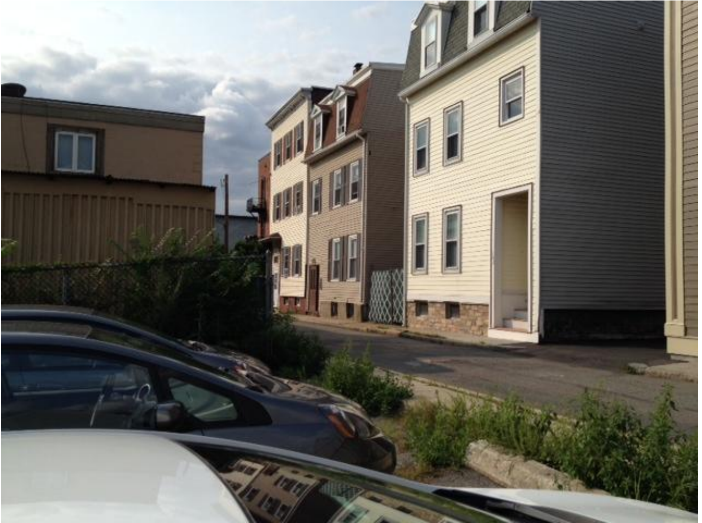
View of site to the left, showing residences across Athens Street