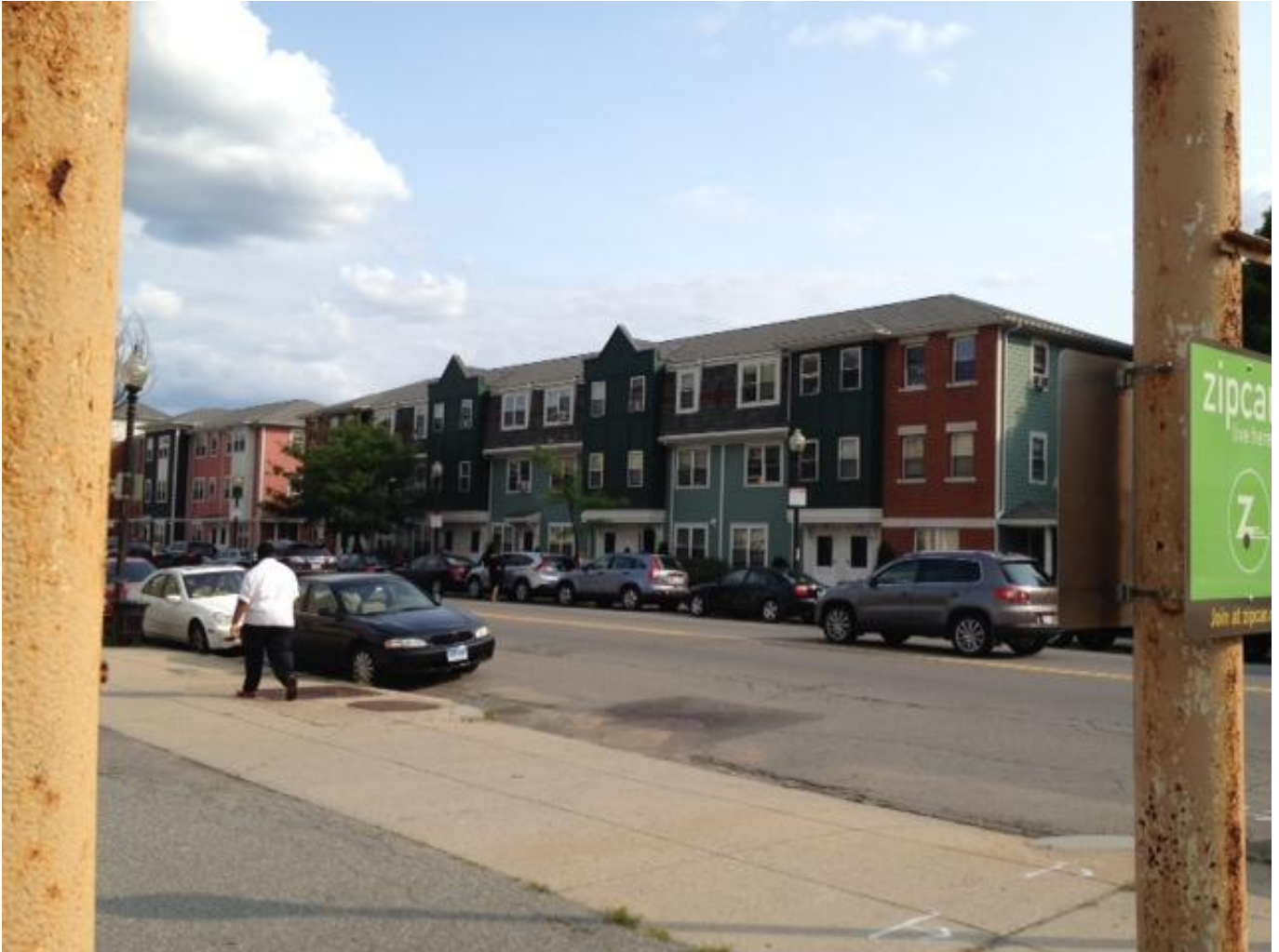
View from Gardner Place across West Broadway