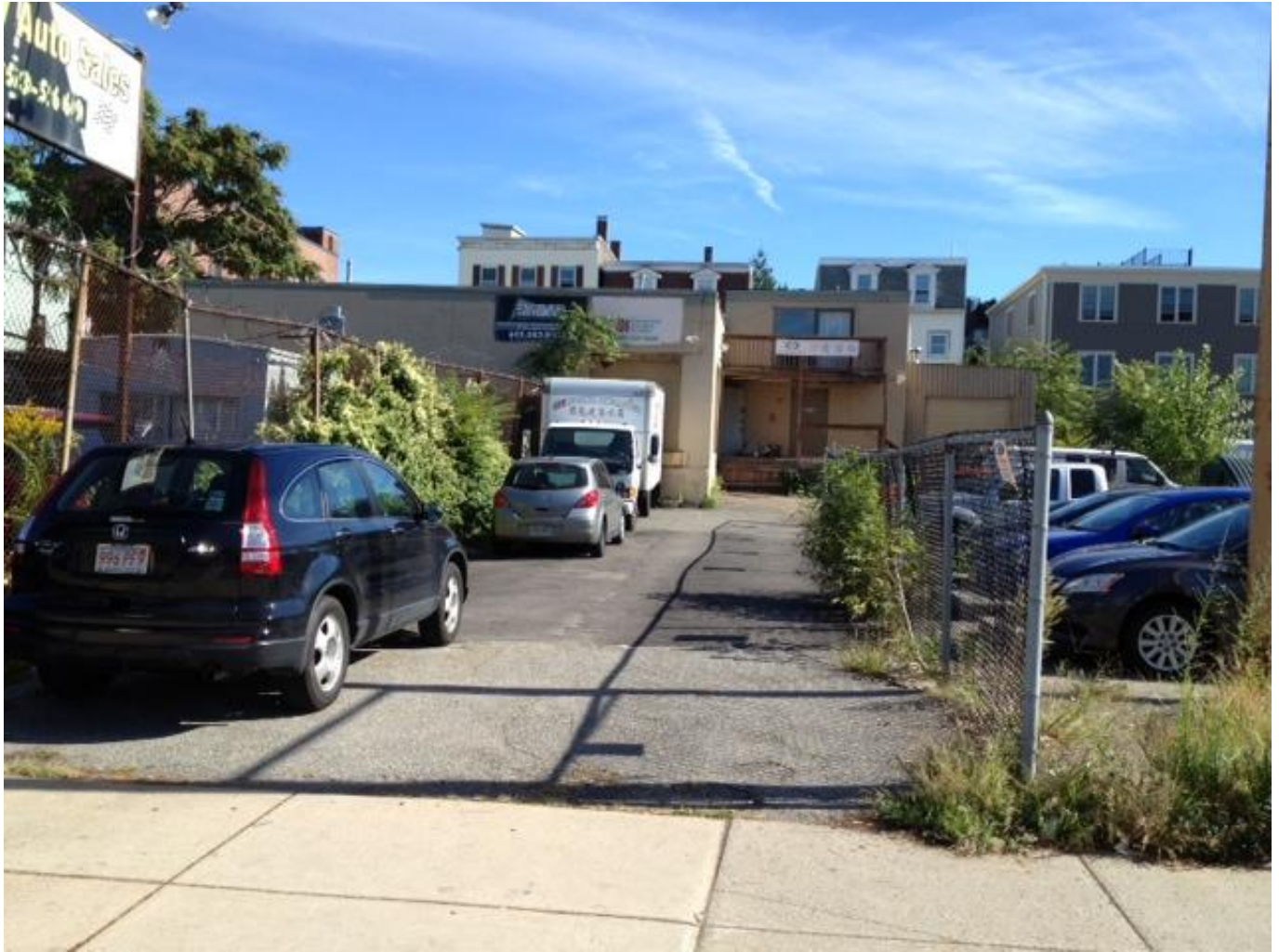
View of site from West Broadway looking down Gardner Place