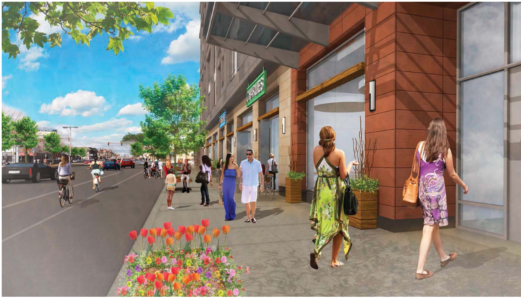
View of new retail along Brighton Avenue