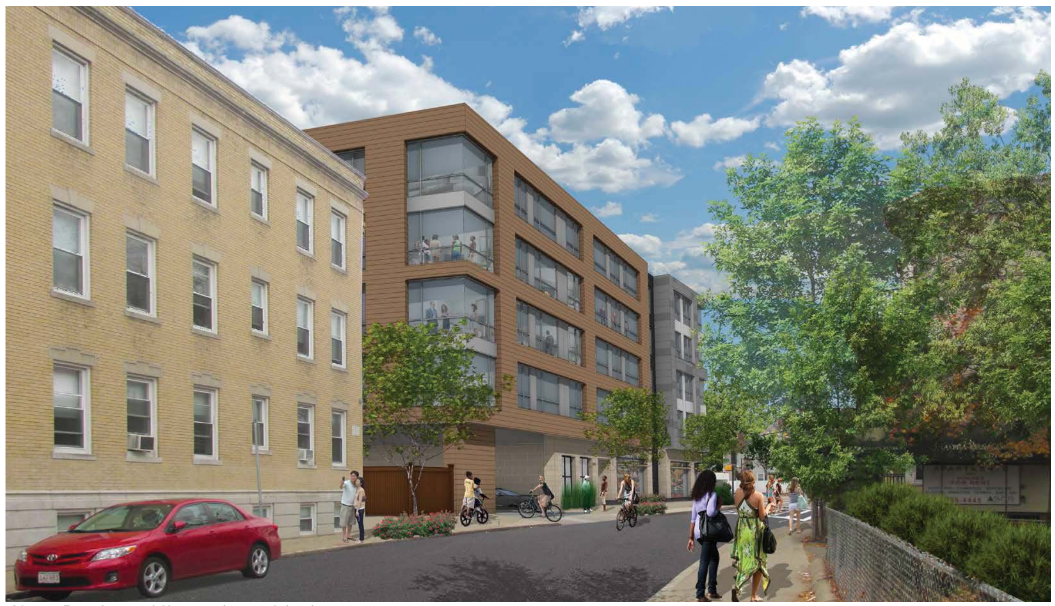
New Design - View along Linden street