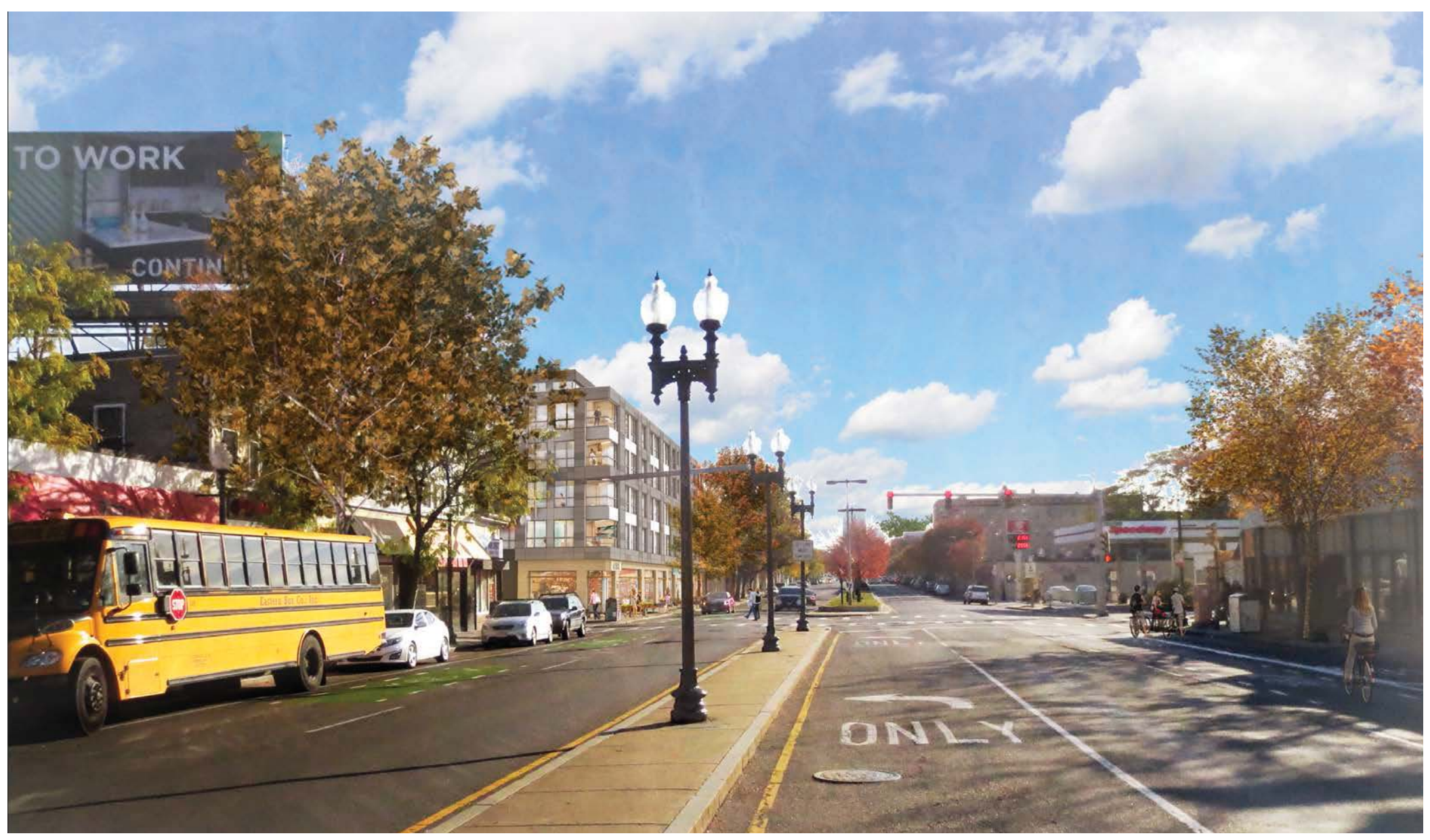
New Design - View along Brighton Avenue & Linden Street