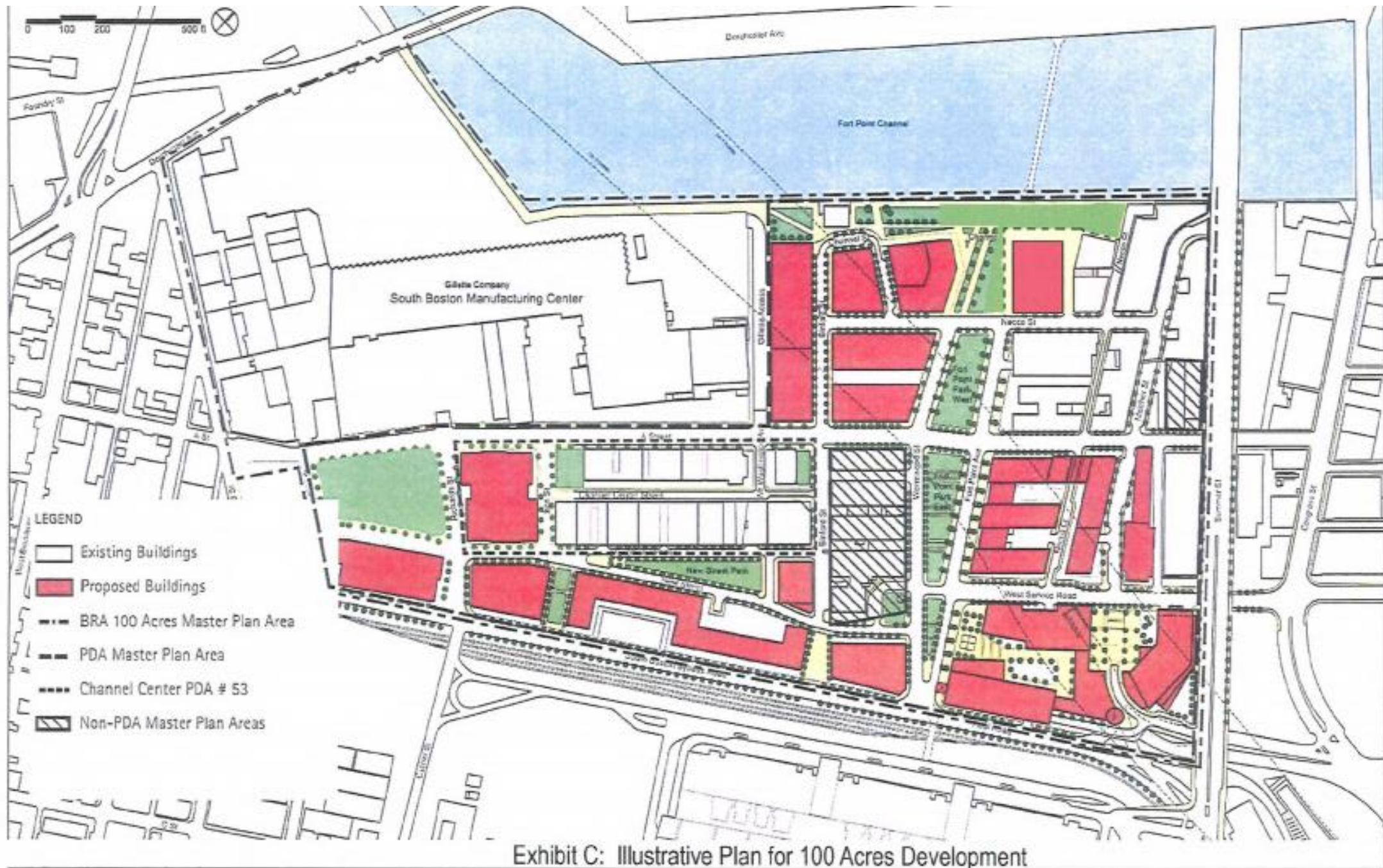
Exhibit C: Illustrative Plan for 100 Acres Development