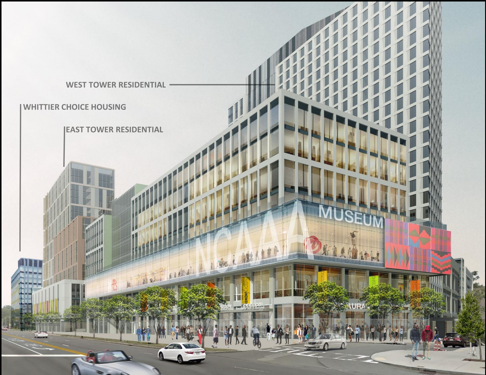
NCAA MUSEUM - Looking East on Tremont Street