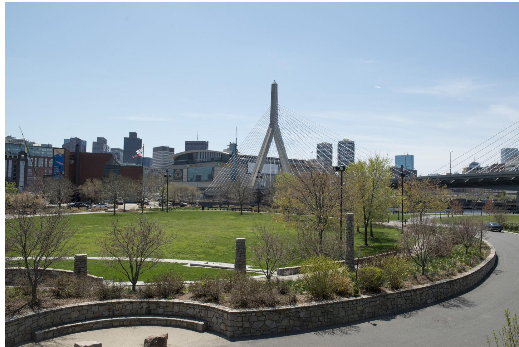
Paul Revere Park, Charlestown