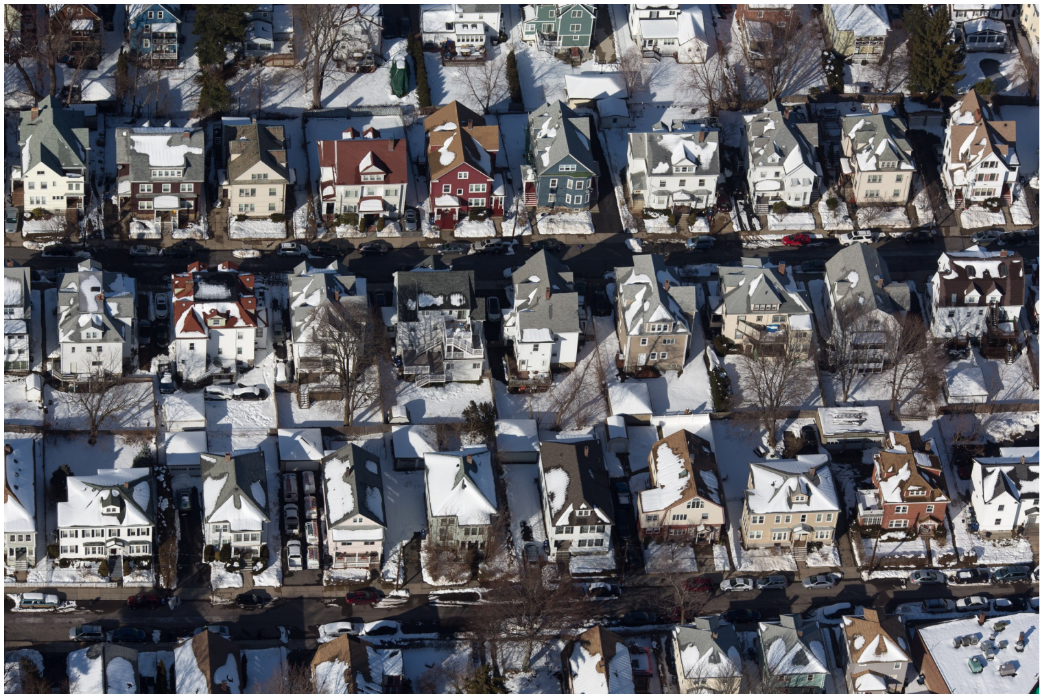
Brighton, Aerial Landslides Photography